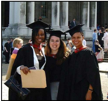
Graduation, University of Greenwich, London, UK